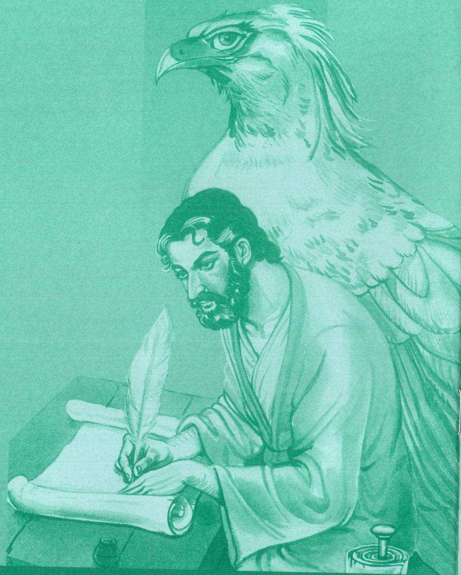
ST. JOHN THE EVANGELIST

Department of Catechism, Major Archdiocese of Trivandrum Samannuaya Pastoral Centre, Pattom