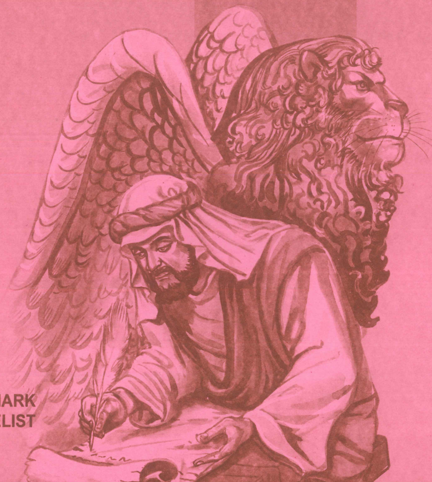
ST. MARK THE EVANGELIST

Department of Catechism, Major Archdiocese of Trivandrum Samannuaya Pastoral Centre, Pattom